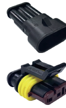
3 Pole Male / Female Housing 3 Pcs each