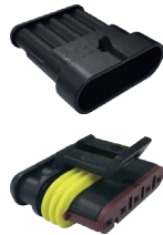
5 Pole Male / Female Housing 2 Pcs each