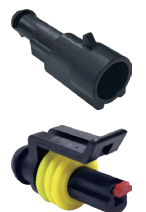
1 Pole Male / Female Housing 4 Pcs each