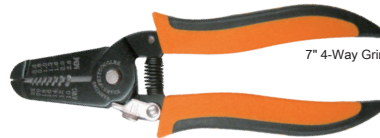
7" 4-Way Grinding Wire Stripper (With Lock) 1 Pc