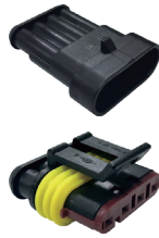
4 Pole Male / Female Housing 2 Pcs each