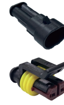
2 Pole Male / Female Housing 3 Pcs each