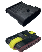
6 Pole Male / Female Housing 2 Pcs each