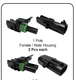
2 Pole Female / Male Housing 1 Pc each