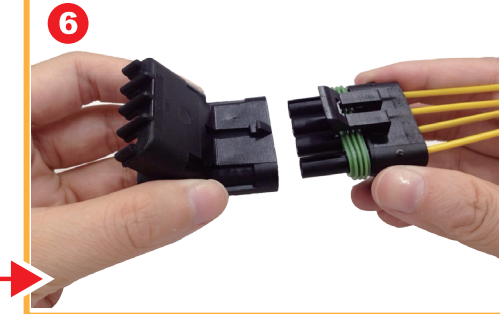
Once all terminals are inserted, Connect together until locked.