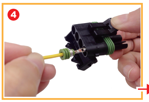
Insert crimped Weather Pack Terminal into connector housing.